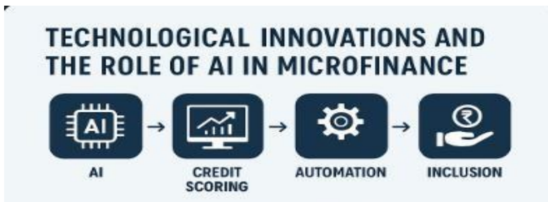
Figure 3: Role of AI in microfinance

AI-driven platforms and chatbots can play a significant role in improving financial literacy among rural populations. Interactive mobile applications using natural language processing (NLP) can educate borrowers about budgeting, interest rates, and responsible borrowing in their local languages. These tools empower individuals to make informed decisions, thereby reducing over-indebtedness and improving repayment behavior.